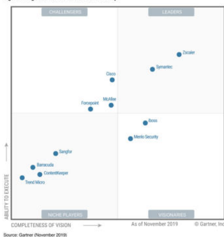
Figure 1. Magic Quadrant for Secure Web Gateways

“We have over 350,000 employees in 192 countries in 2,200 offices being secured by Zscaler.”